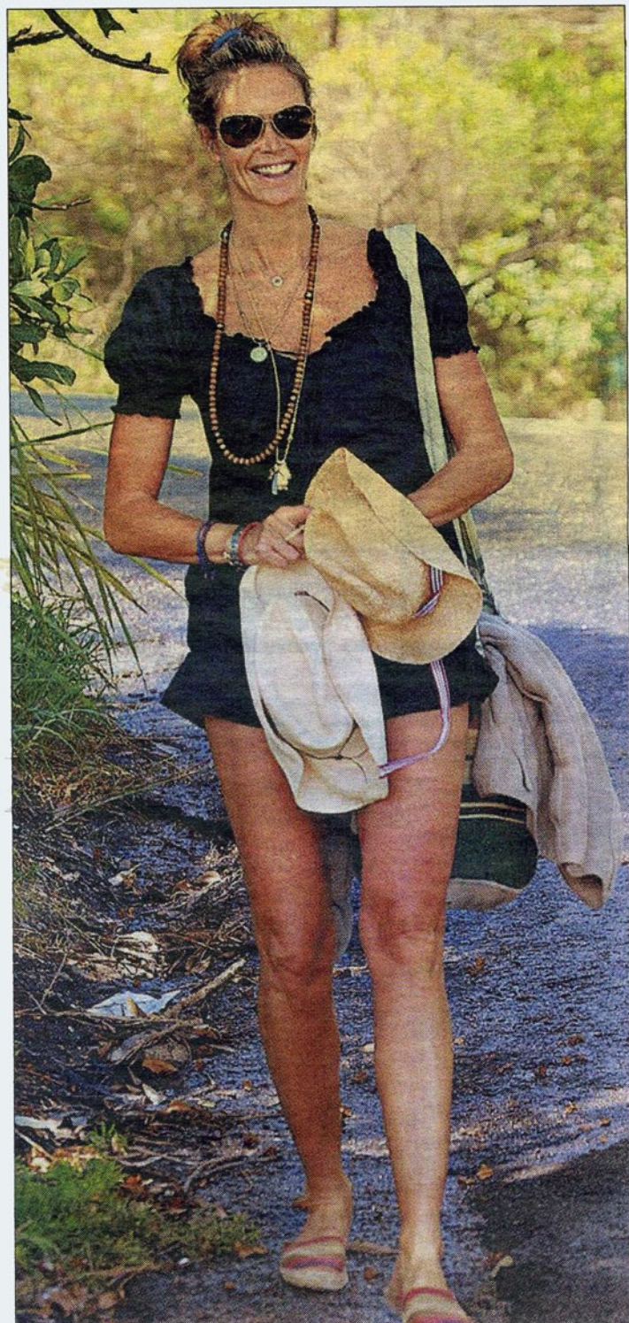
Looking good: Elle Macpherson yesterday