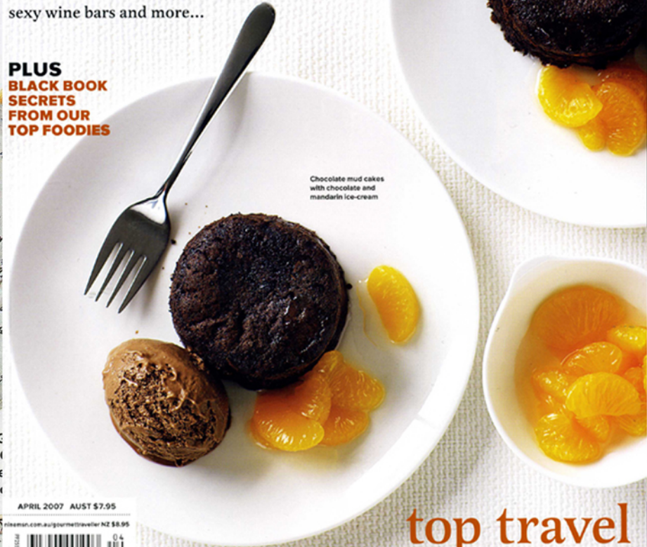
Chocolate mud cakes with chocolate and mandarin ice-cream

PLUS BLACK BOOK SECRETS FROM OUR TOP FOODIES