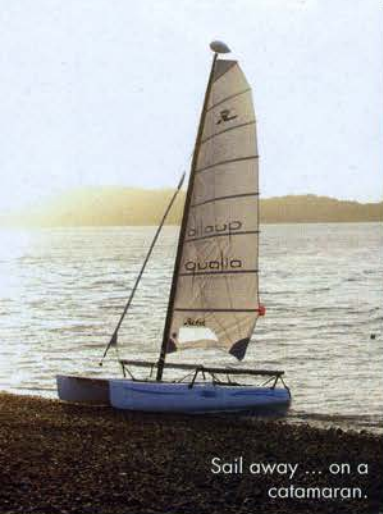
Sail away ... on a catamaran.