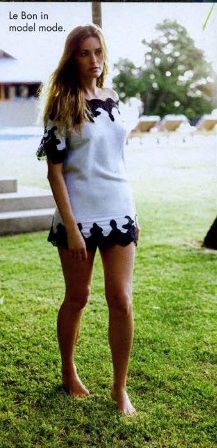
Le Bon in model mode.