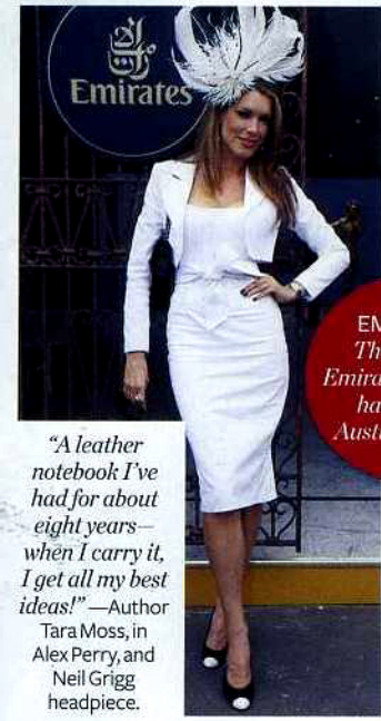
EMIRATES The opulent Emirates marquee had a regal Austrian theme.