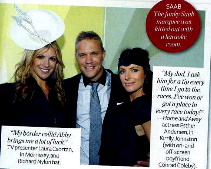
SAAB The funky Saab marquee was kitted out with a karaoke room.