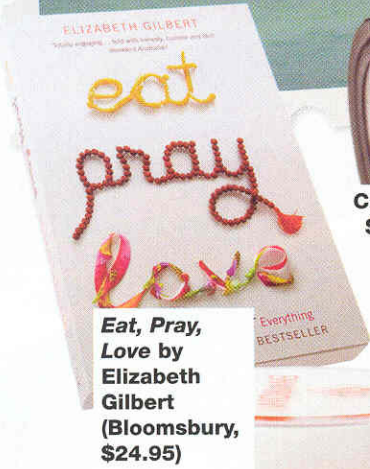
Eat, Pray, Love by Elizabeth Gilbert (Bloomsbury, $24.95)