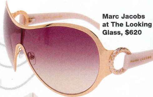
Marc Jacobs at The Looking Glass, $620