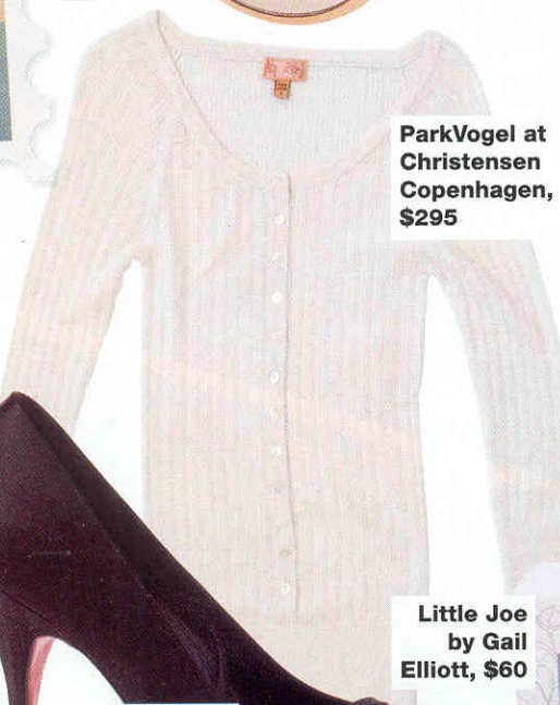
ParkVogel at Christensen Copenhagen, $295