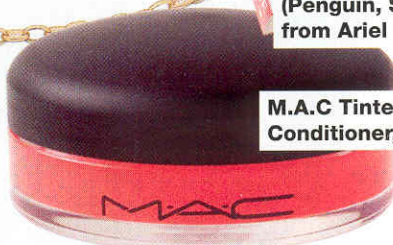
M.A.C Tinted Lip Conditioner, $28