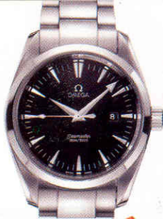
Omega Seamaster Aqua Terra Quartz, $2125