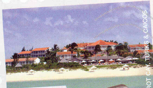
PARROT CAY, TURKS & CAICOS