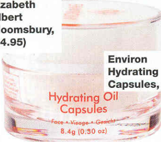
Environ Hydrating Oil Capsules, $96