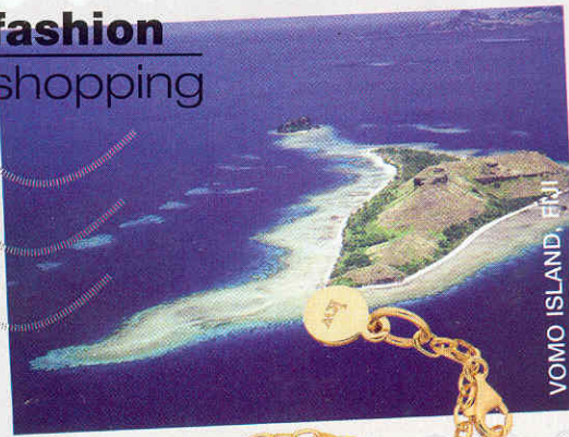
VOMO ISLAND, FIJI