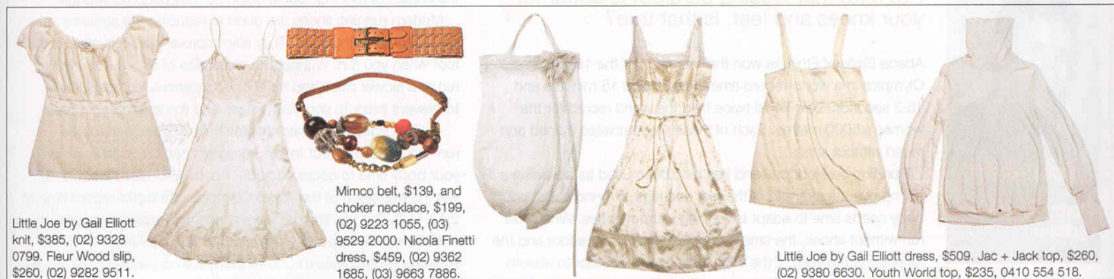
Little Joe by Gail Elliott knit, $385, (02) 9328 0799. Fleur Wood slip, $260, (02) 9282 9511.