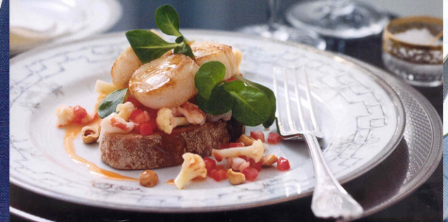
Scallops, cauliflower and hazelnuts with tomato and prawn vinaigrette

NDULCE relaxed christmas lunch modern tapas menu classic french desserts gorgeous table settings asmania's best restaurants