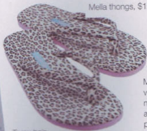
Mella thongs, $120.