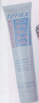
Terax hair treatment, $25.