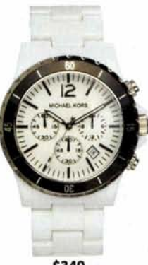
$349 Michael Kors watch 1800 818 853