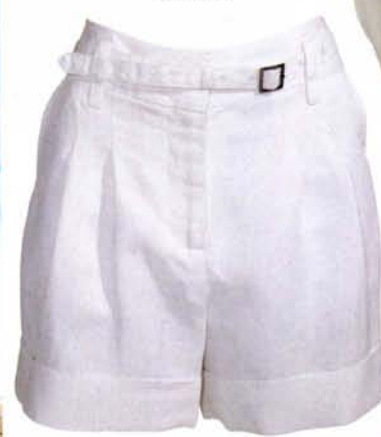
$129 Jigsaw shorts 1800 621 757