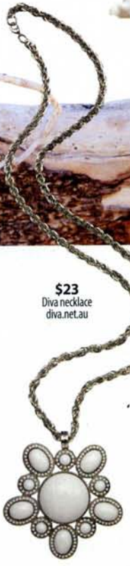
$23 Diva necklace diva.net.au