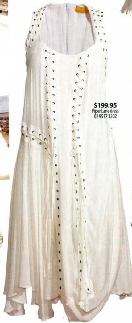
$199.95 Piper Lane dress 02 9517 3202