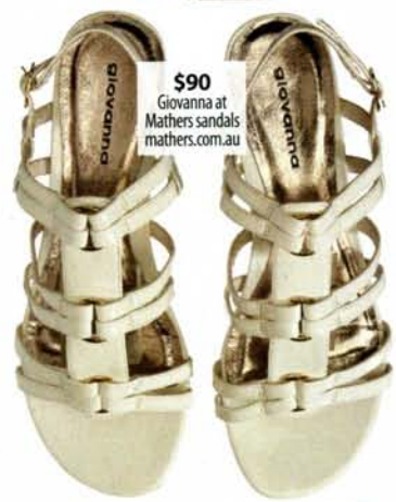
$90 Giovanna at Mathers sandals mathers.com.au