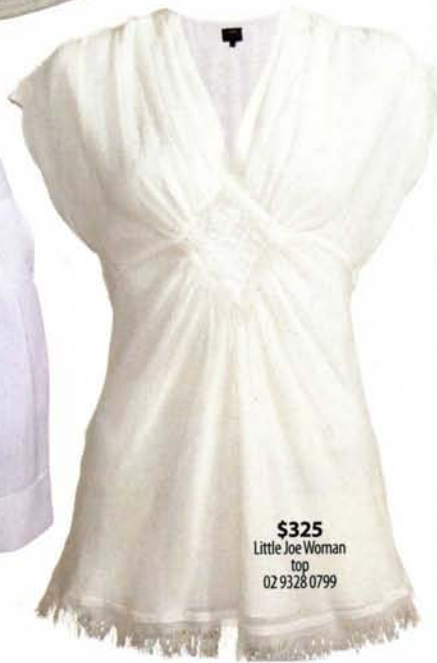
$325 Little Joe Woman top 02 9328 0799