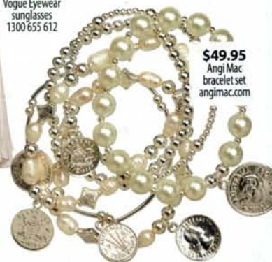
$49.95 Angi Mac bracelet set angimac.com