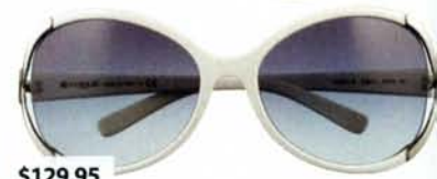
$129.95 Vogue Eyewear sunglasses 1300 655 612