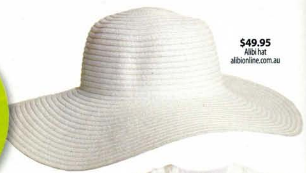
$49.95 Alibi hat alibionline.com.au

WHITE Simple yet sophisticated, these pieces can be thrown on for effortless, white-hot summer style