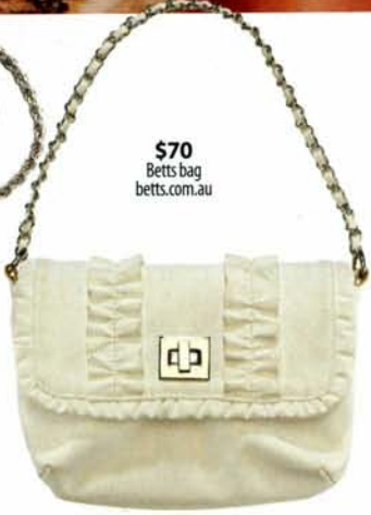
$70 Betts bag betts.com.au